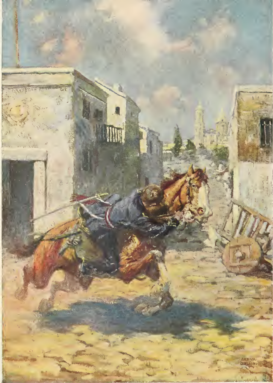
GRANT RUNNING THE GANTLET OF THE MEXICANS AT MONTEREY IN RIDING TO THE RELIEF OF HIS COMRADES.